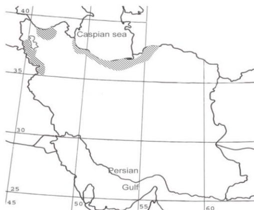
Fig. 2. Geographical distribution of Helvella species in Iran.

All of the species reported from Iran, have been collected from North and North-West (Fig. 2) of the country. Most of the specimens of all recorded species have been collected from broad leaf forest-type localities in Golestan, Mazandaran, Guilan and Eastern Azarbaijan (Arasbaran forests). Specimens of H. elastica , H. ephippium and H. lacunosa were collected from non-forest localities in Western Azarbaijan (Orumieh, Piranshahr to Oshnavieh, Naghadeh to Oshnavieh, Oshnavieh to Piranshahr, Piranshahr to Sardasht, Salmas to Orumieh, Piranshahr to Jaldian) and Kurdistan provinces (Marivan).