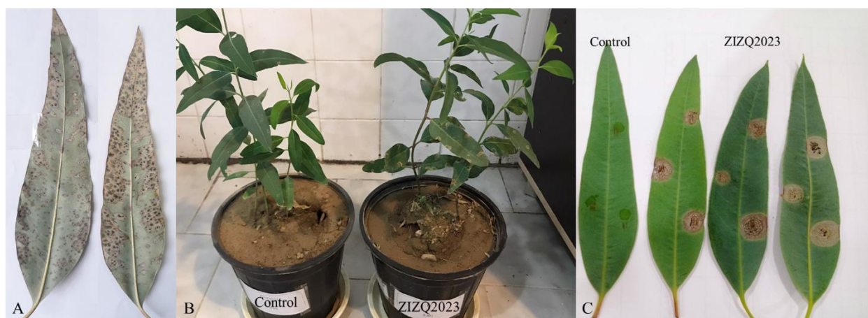
Fig. 3. Leaf spot symptoms caused by Pestalotiopsis biciliata A: in vivo , B-C: On seedlings and detached leaf of Eucalyptus, 10 days after inoculation in pathogenicity test.