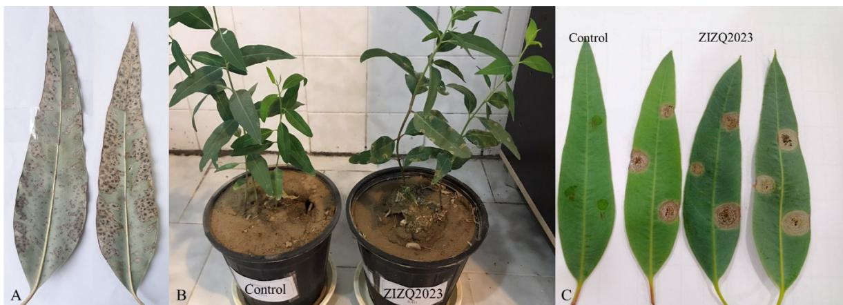
Fig. 3. Leaf spot symptoms caused by Pestalotiopsis biciliata A: in vivo , B-C: On seedlings and detached leaf of Eucalyptus, 10 days after inoculation in pathogenicity test.

studies conducted globally have documented the presence of P. biciliata on grapes, Taxus spp. and Platanus spp. (Maharachchikumbura et al. 2014).