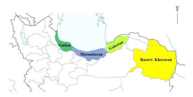
Fig. 2. Geographic distribution of blast disease in four provinces of Iran.