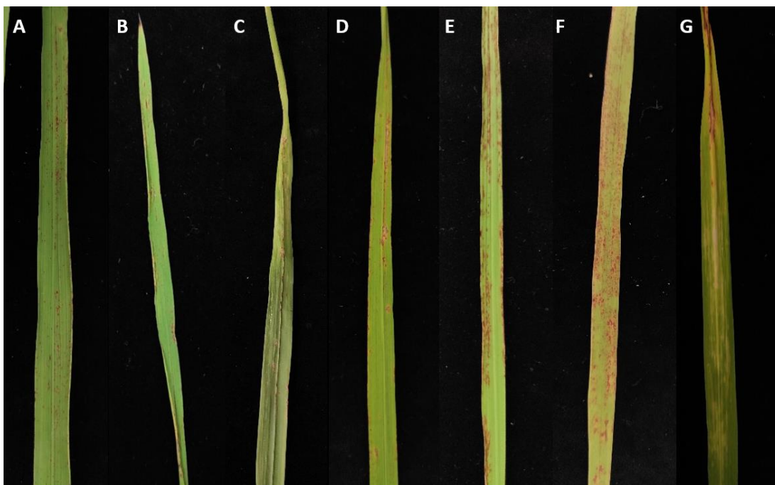
Fig 1. Reactions of rice to Pyricularia oryzae , at the three-leaf stage, to inoculations with 10^5 conidia/ml containing Tween 20 suspension of IMT8 isolate at 6 days after inoculation and maintaining in the greenhouse with a 12/12 light and dark period and 75-95% relative humidity. A) Hashemi, B) Alikazemi, C) Domsiyah, D) Sang Tarom, E) Champa, F) Binam, G) Tarom Mahali.