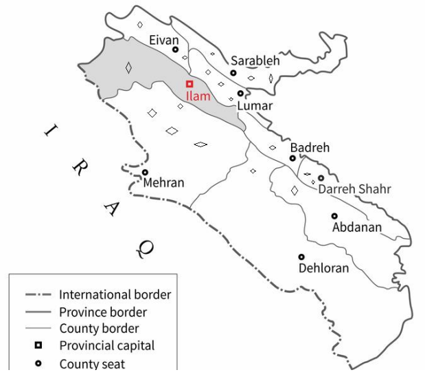
Fig. 1. Geographical location of sampling sites of Fusarium oxysporum f. sp. phaseoli populations in Ilam province.