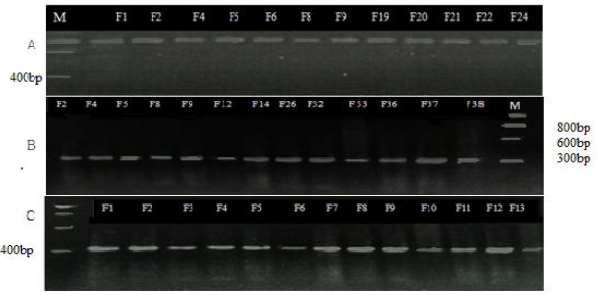
Fig. 2. Banding pattern of MB17 (A) and MB14 (B) and MB10 (C) primers on Fusarium oxysporum f. sp. phaseoli . M indicates 1Kbp DNA ladder and F1, F2, ..., F24 indicate the isolates code.

The average number of bands per gene locus was one. The highest number of bands was 58 at MB14 and the lowest number at 55 at MB9. The average number of alleles ( N_a ) observed among populations was 1.484 and the mean number of effective alleles ( N_e ) among populations (1.438), with the highest number of alleles (1.480) in Malekshahi population then that in Chardavol and Ayvan populations with 1.476 and 1.432, respectively and the lowest number of effective alleles was found in Sirvan population with 1.394 (Table 4).